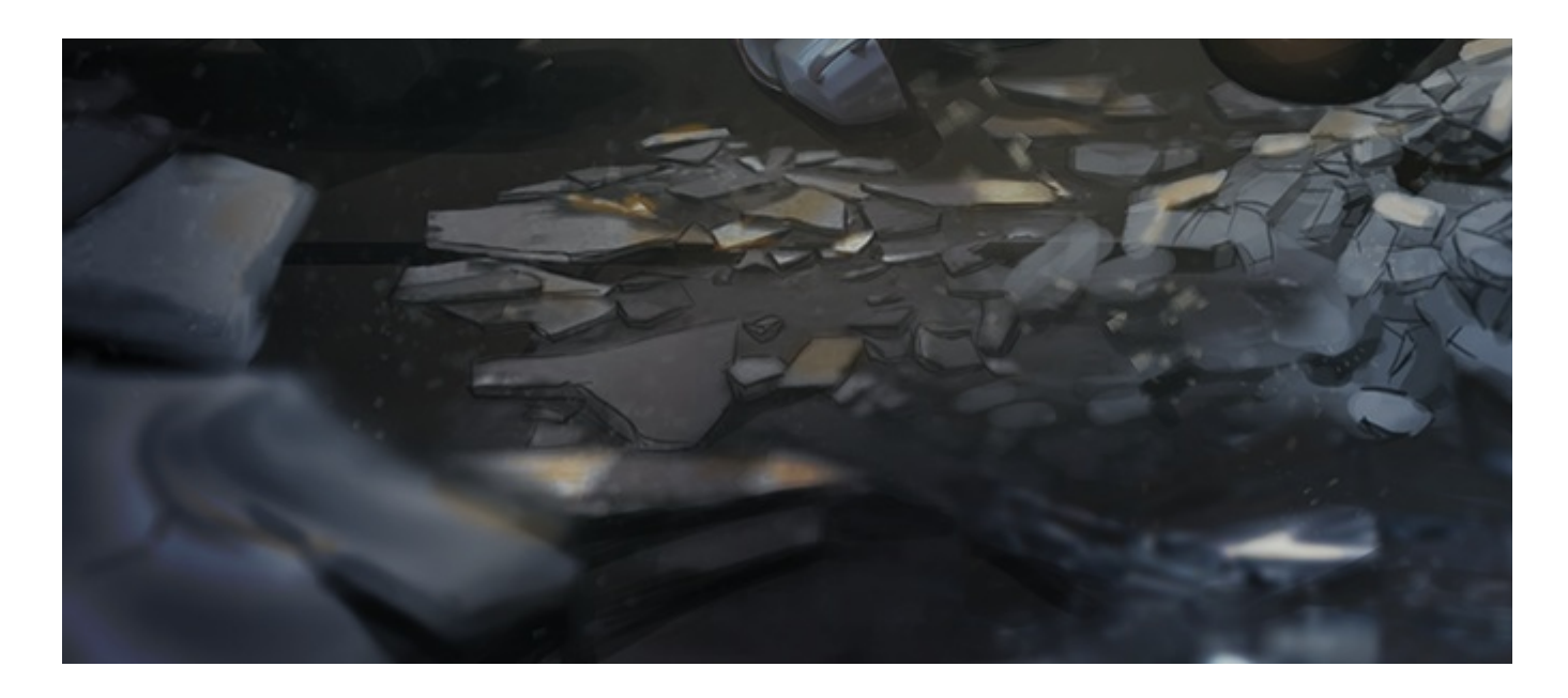
Please give your love to @gildedshivers on Tumblr for this incredible piece she did for me.